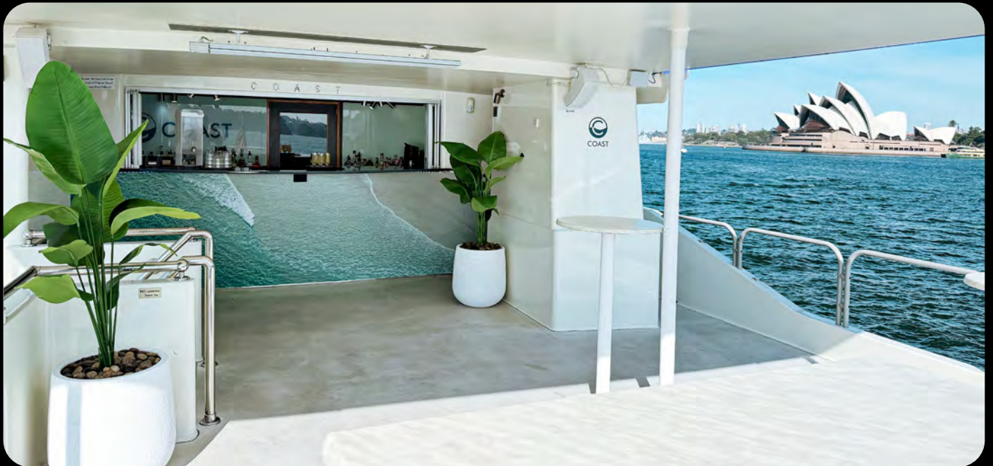
Upper deck aft