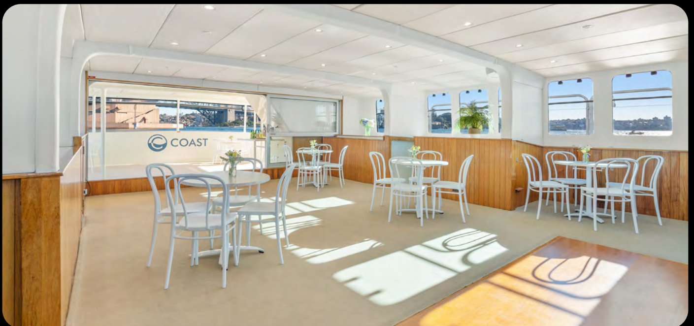
Lower deck interior