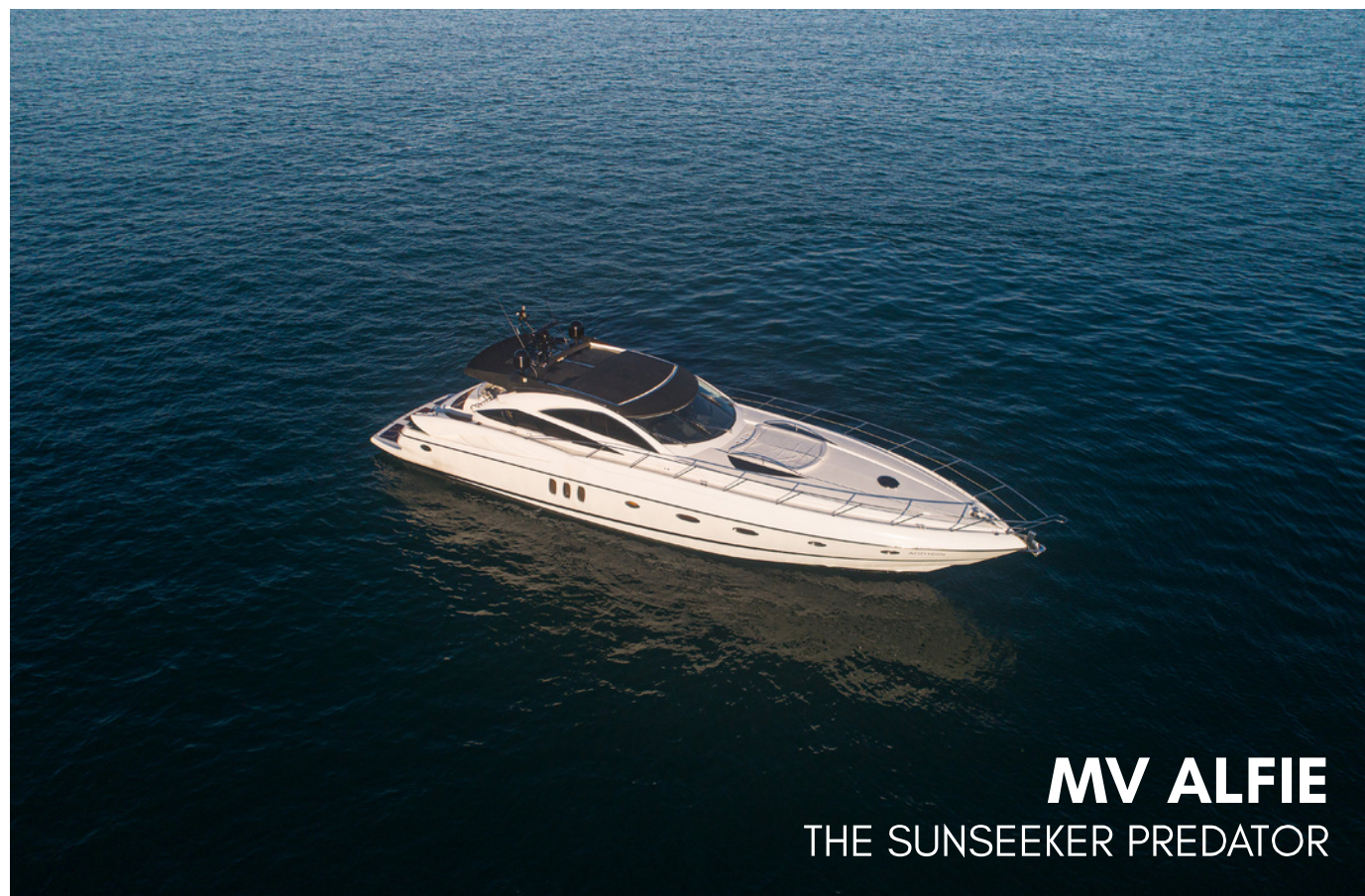
MV ALFIE THE SUNSEEKER PREDATOR

Sleeps: 6 Queen Cabin: 2 Twin Cabin: 1 Length: 68ft / 20.73m